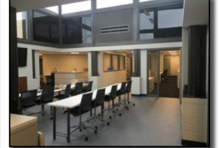
Construction Progress Photos